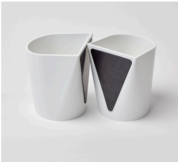
Available as a set of 2