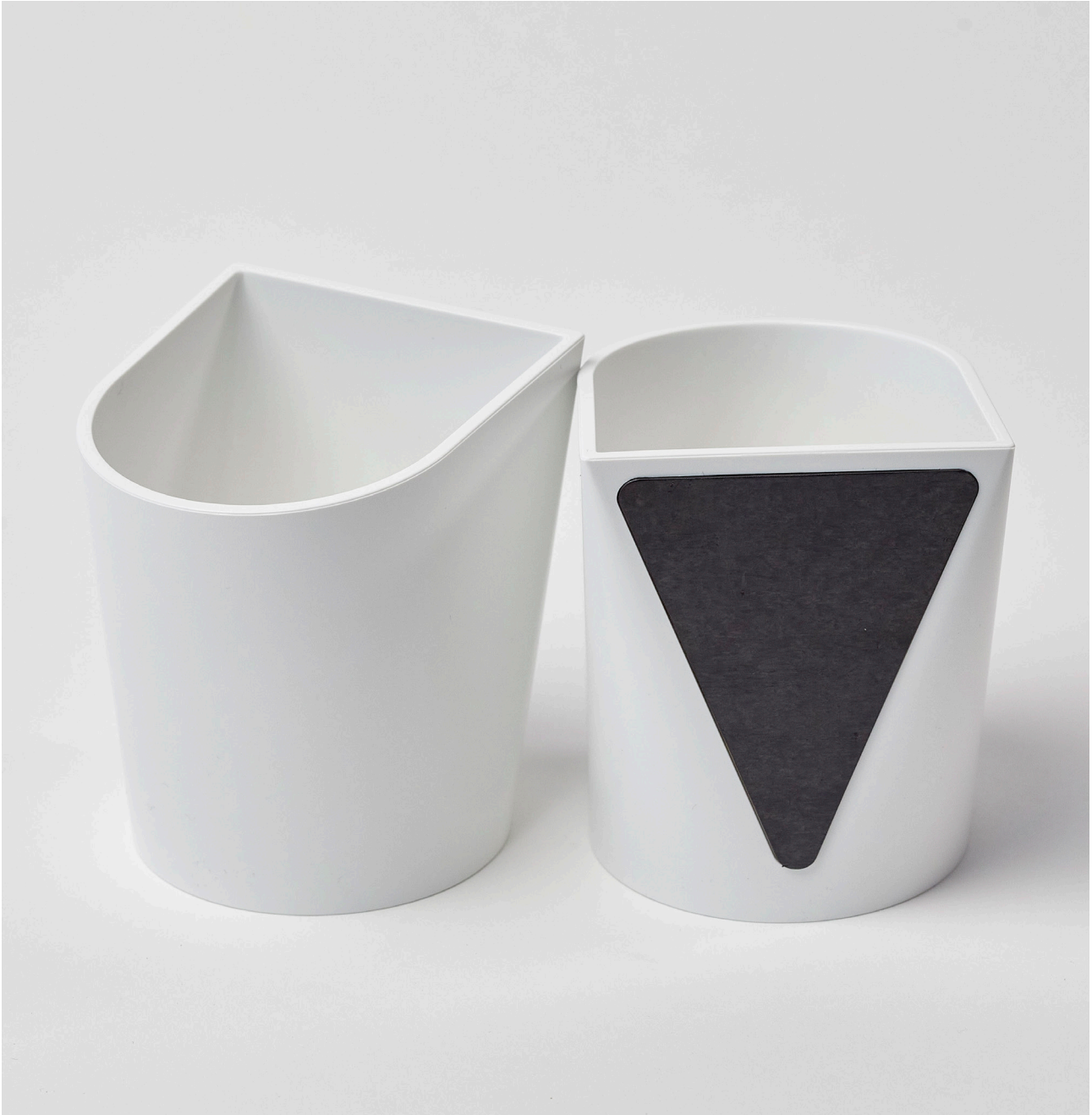
A practical workplace accessory